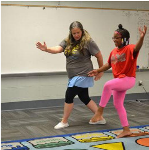
Mime's the Word! - Workshop