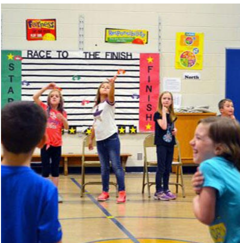
Theater of Physics