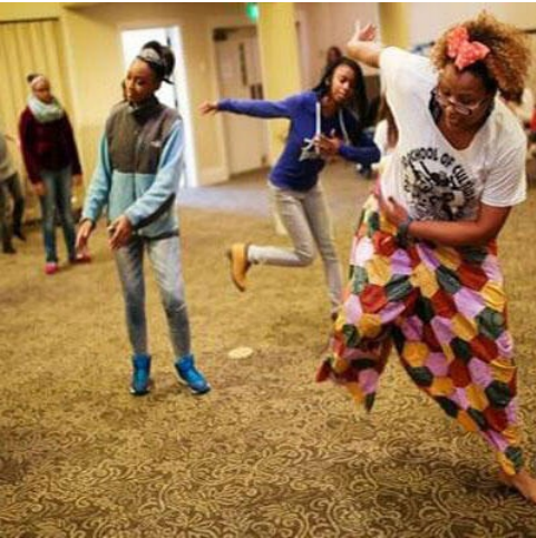
Cultural Dance of West Africa