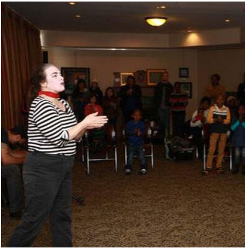
Mime's the Word! - Performance